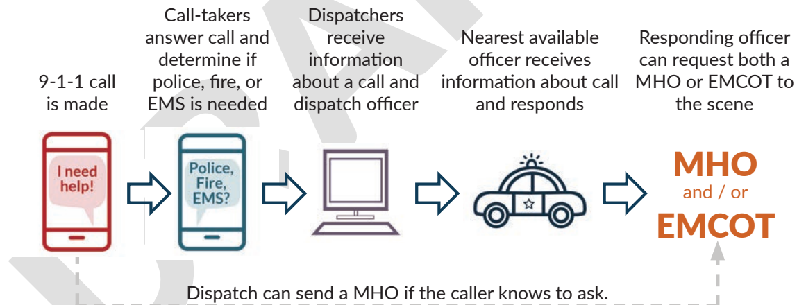
Exhibit 3: Overview of 9-1-1 Call Process

SOURCE: OCA interviews with APD management and analysis of APD communications policies and instructions, March - July 2018.